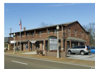
5788 STAGE RD 7,121 SF Office / Retail 1,500 SF Vacant $10.40 / SF MG