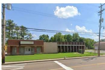
5803 STAGE RD 3,764 SF Office/ Retail $4,000/ Month