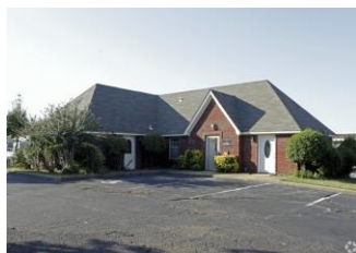
2855 PRICE DR 1,552 SF Medical Office